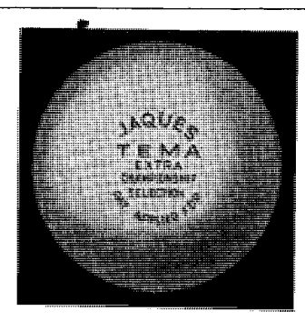
AS USED AT 1935 WORLD'S CHAMPIONSHIPS